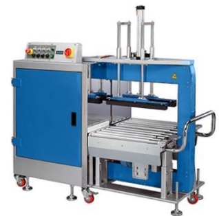
* Model TP702YA with Dual press bar option